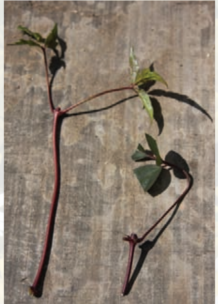
Clematis cuttings: nodal (left) and internodal (right)